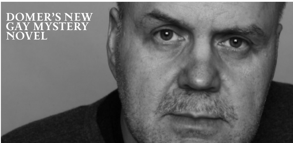
DOMER'S NEW GAY MYSTERY NOVEL